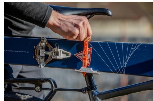
5. Same thing for the back strap.