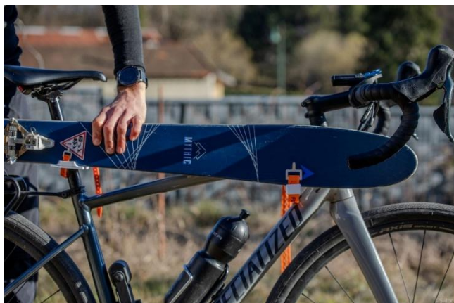
2. Add the second ski.