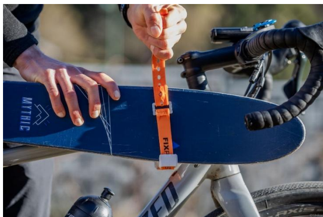
4. Tighten the strap firmly.