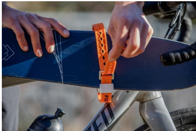
3. Pass the strap through the metal ring.