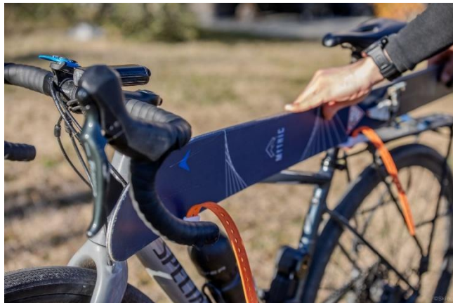
1. Place the first ski in the slots